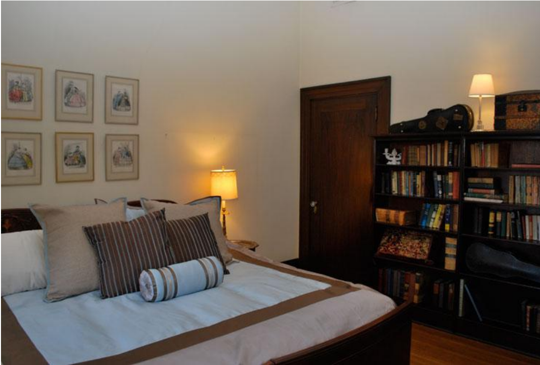
The Tangeman's Suite

This four-room suite includes a large parlor, private bath with shower, bedroom, kitchenette, and sunroom. The parlor can accommodate a conference table for small business gatherings or more sleeping space for additional guests. Please let us know how we can meet your needs.