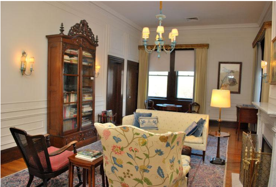
The Tangeman's Sitting Room