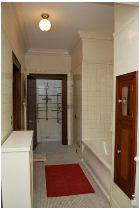
The Bachelor's Suite Bath