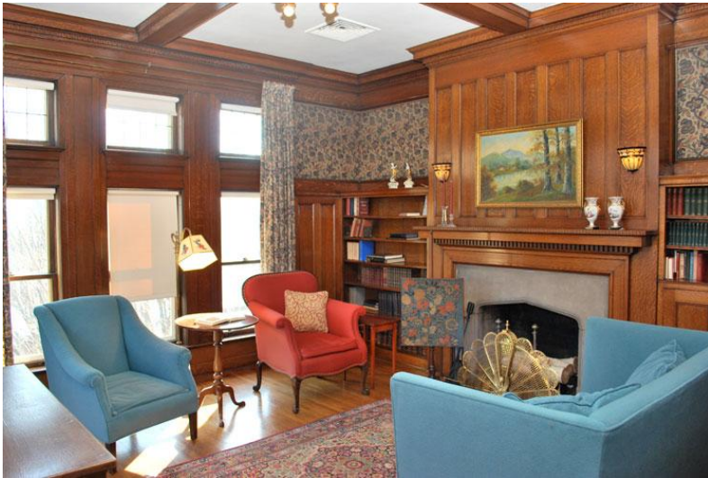
The Bachelor's Suite

In this ultra private offering, you'll have the extraordinary third floor to yourself. Nearly the entire suite is finished with ornately detailed quarter-sawn white oak paneling with tapestries above. The parlor has a limestone fireplace and an amazing birds-eye view of the entire Gardens. There is a generous changing room with lots of built-in cabinetry. The bathroom boasts perhaps the most unique wrap-around shower imaginable in the early 1900's... complete with a skylight!