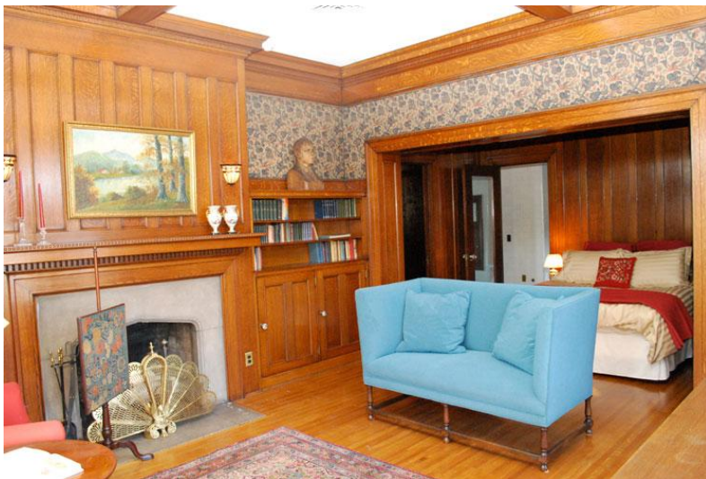
The Bachelor's Quarters